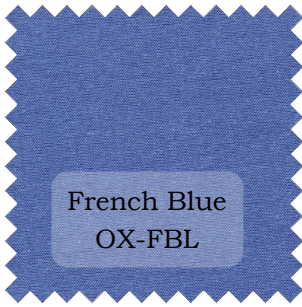
French Blue OX-FBL